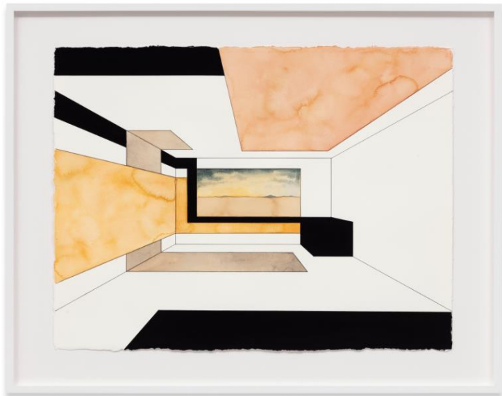
Andrea Zittel, Panels and Portals #2 , 2020 Watercolour, gouache, paper Courtesy Sprüth Magers, Berlin © Andrea Zittel, Courtesy the artist and Sprüth Magers, photo: Timo Ohler