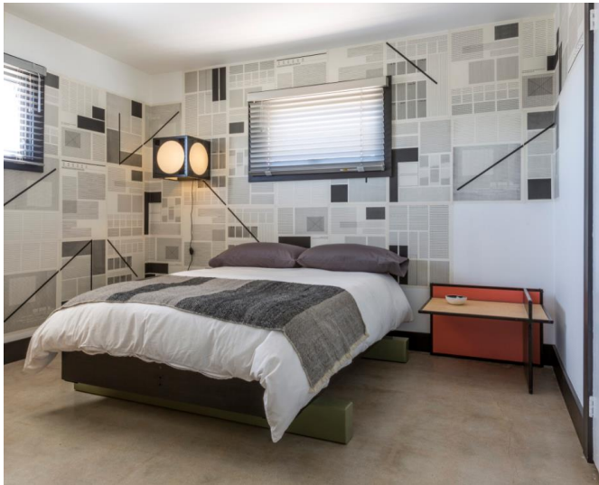
Andrea Zittel, Pattern Fields: Multiple Stories Under Different Headlines (Version 2), 2020 Screen print on newspaper, installed in A-Z West © Andrea Zittel