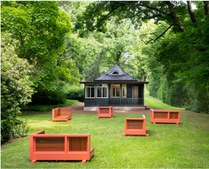
Andrea Zittel, Planar Composition for Esters Garden House , 2022

Sculpture Garden, collection Kunstmuseen Krefeld & Freunde der Kunstmuseen Krefeld e.V.