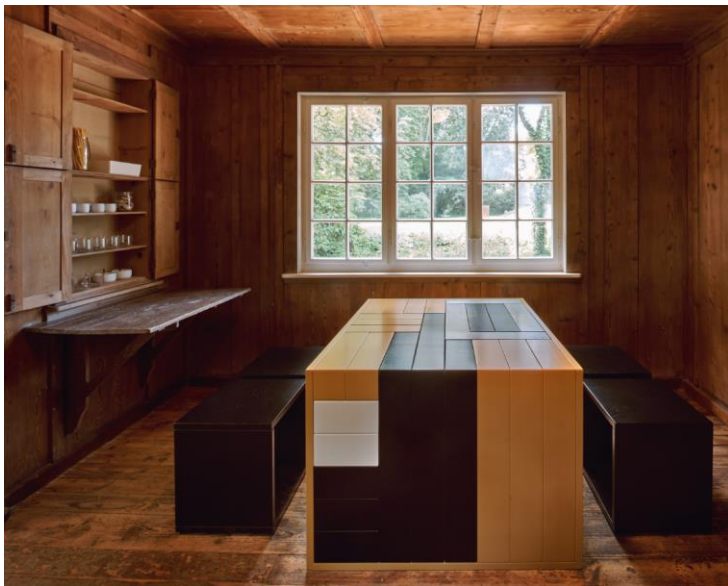
Andrea Zittel, Planar Composition for Esters Garden House , 2019–2022 Sculpture garden, collection Kunstmuseen Krefeld & Freunde der Kunstmuseen Krefeld e.V. © Andrea Zittel