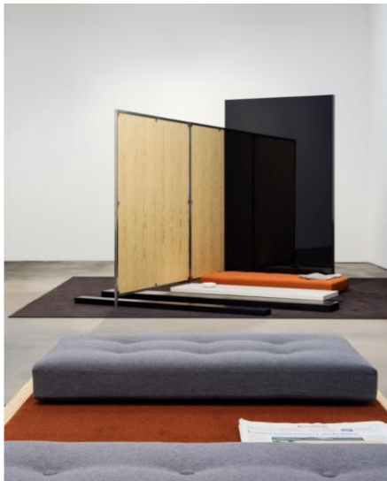
Andrea Zittel, Planar Partition #1 , 2015 Weaving, steel, paint, wood, lacquer, concrete Courtesy Sprüth Magers, Berlin © Andrea Zittel, Courtesy the artist and Sprüth Magers, photo: Timo Ohler